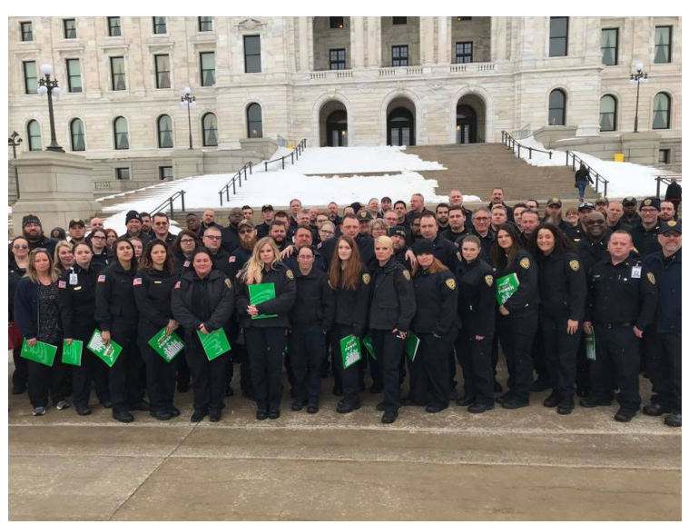
Corrections Lobbying Day 2018

Our top priorities this session include securing funding for safe staffing at all of our corrections facilities and banning private prisons in Minnesota.