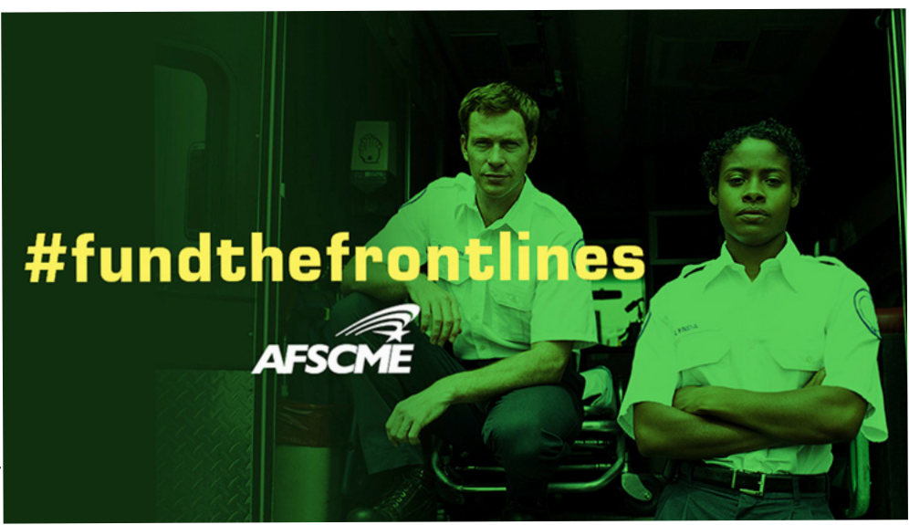
NOW is the time to take action. Call Congress and demand they fund the front lines - before we lose the public services our neighbors are counting on.

Tell the Senate to pass the HEROES Act NOW by signing the petition: bit.ly/2VCw2pw