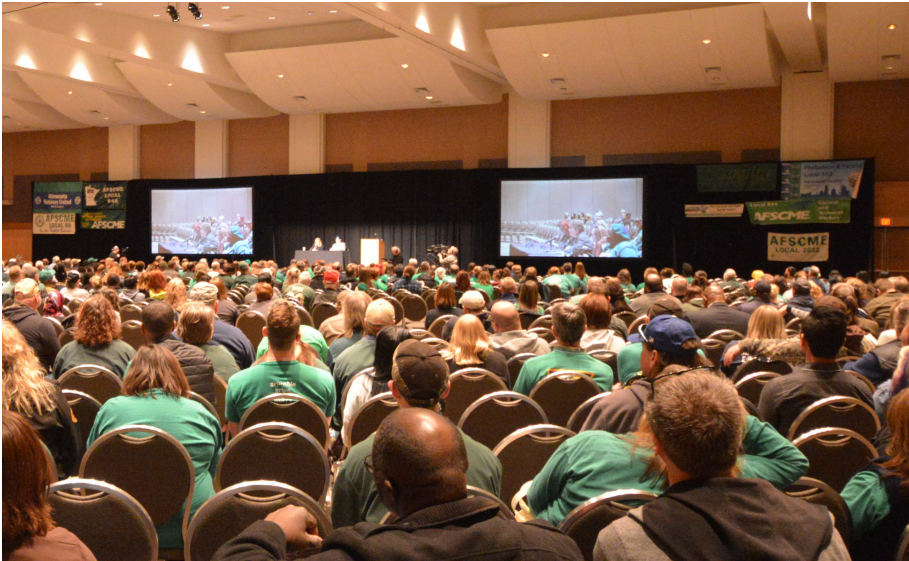
This year's Day on the Hill was one of the Council's highest attended advocacy days.