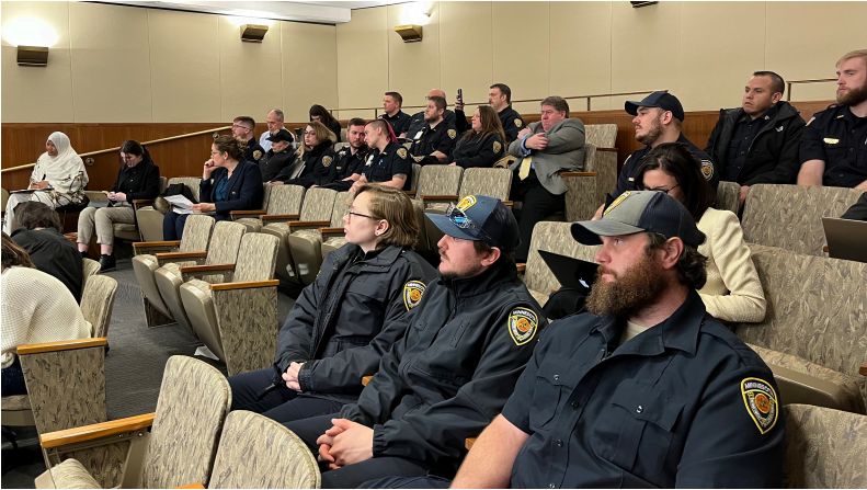
Above: COs gather in committee room to hear their bill to ban private prisons

AFSCME Correctional Officers met with countless legislators from all political parties and House and Senate leadership to hold them accountable to our shared values and the legislative priorities of our corrections members!